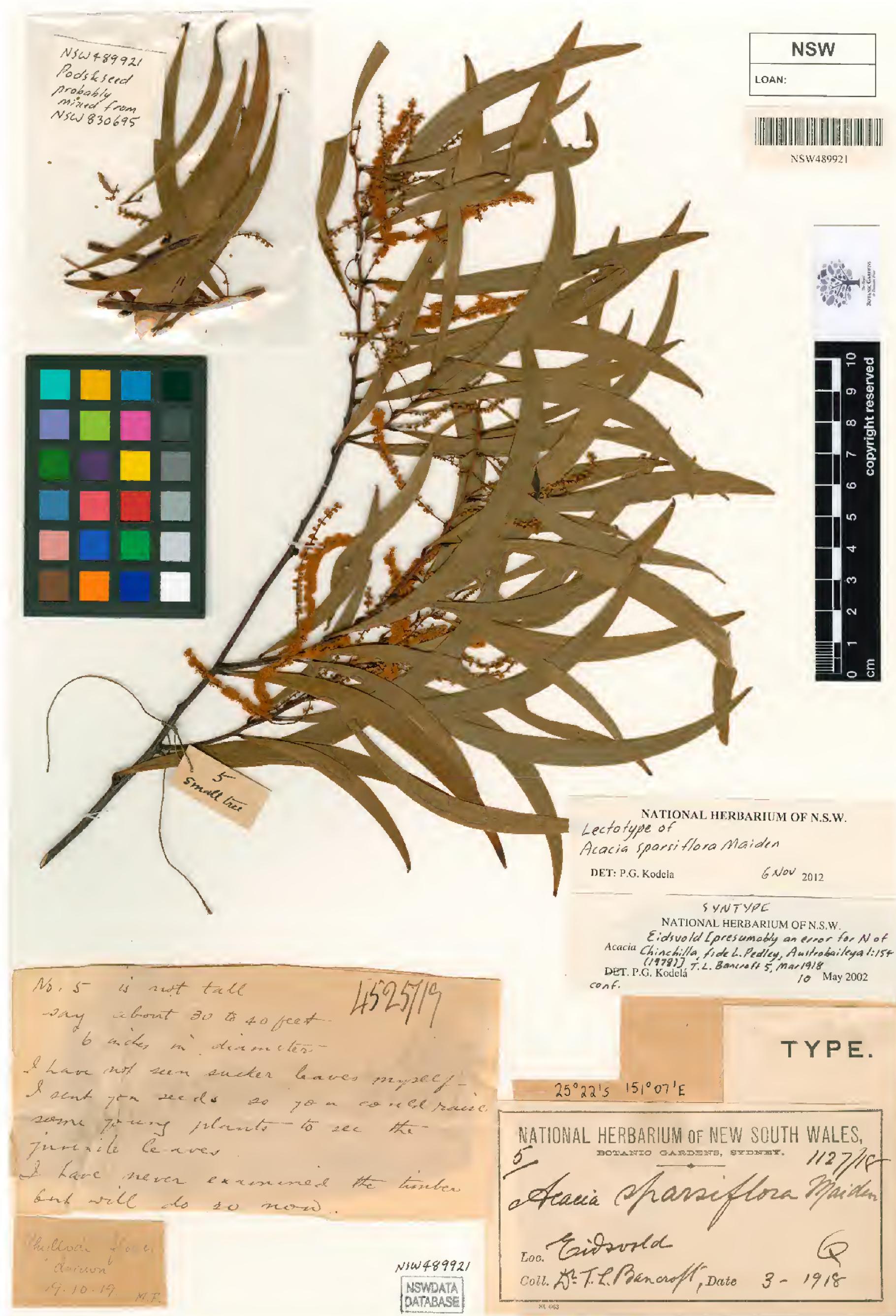
Fig. 5. Lectotype of Acacia sparsiflora Maiden, NSW489921